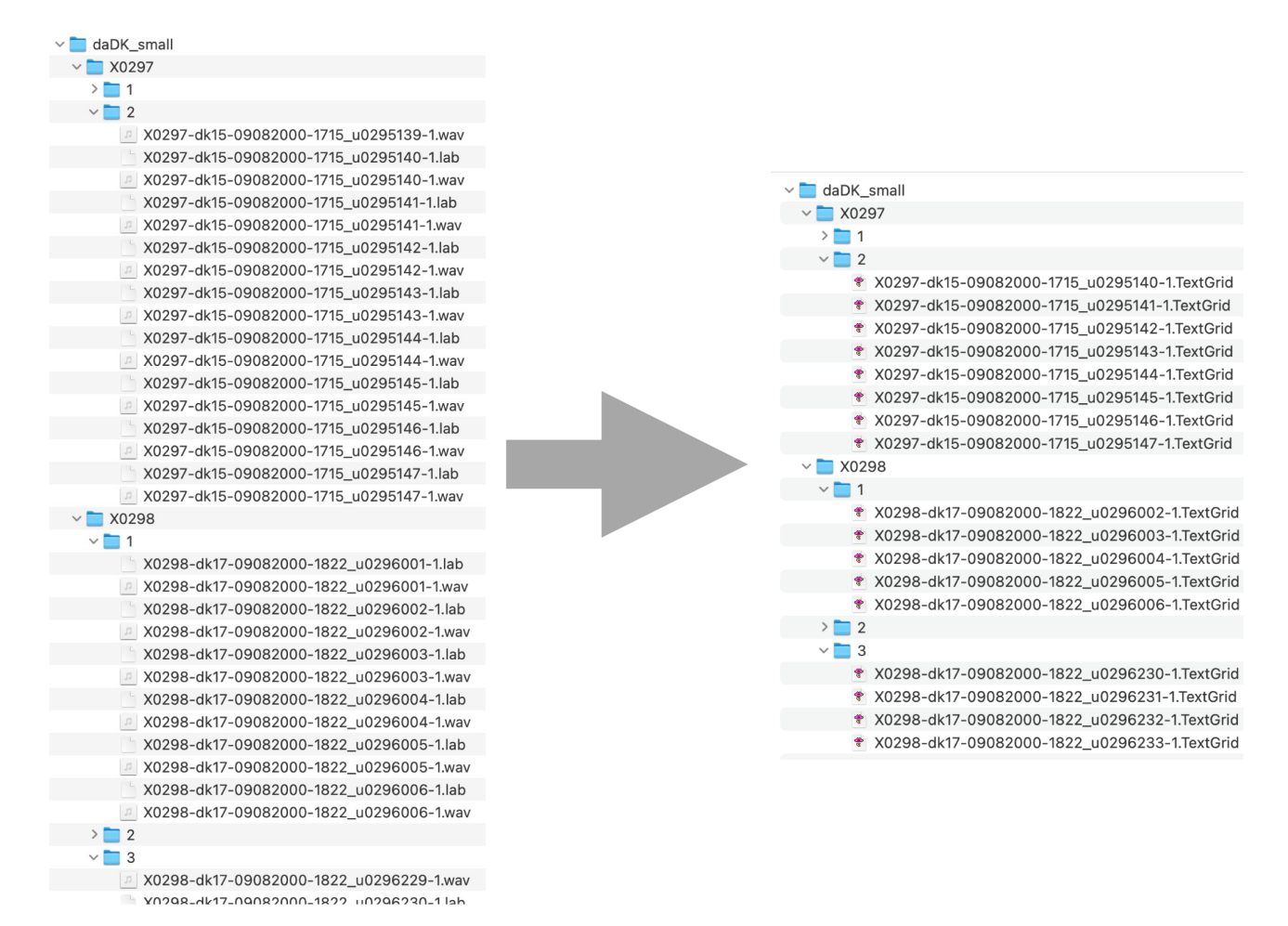
Figure 2: Autophon will output the finished TextGrids using an identical subfolder structure as the uploaded file.